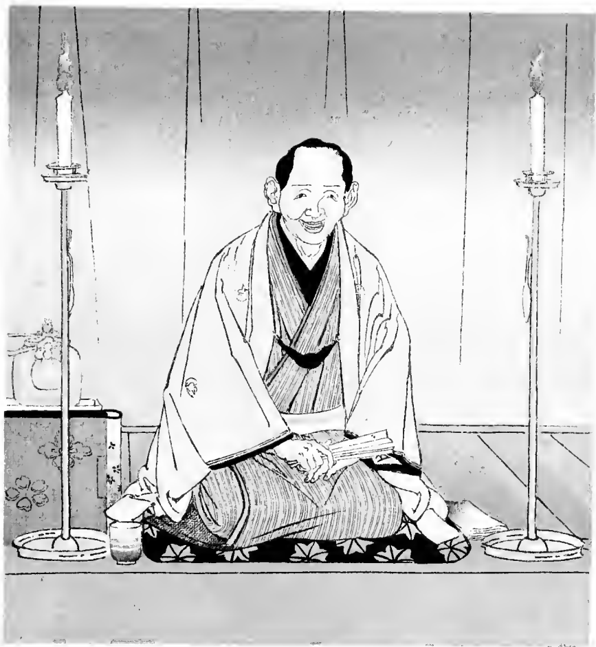
A Professional Story-teller.